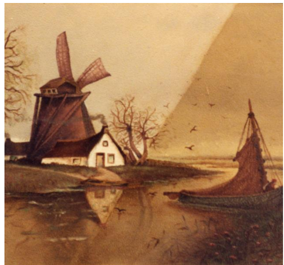
The left side of this painting has been cleaned with Gainsborough Emulsion Cleaner.