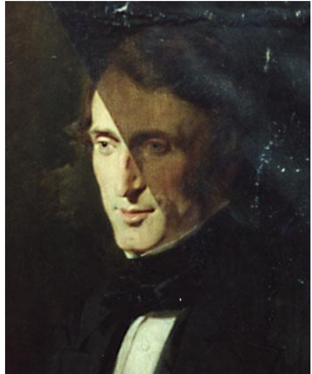
Half of this 19 th century oil painting has been restored to its original appearance by removing the old yellowed varnish with Gainsborough Varnish Remover.